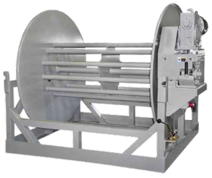
Standard configuration shown with electric rewind motor