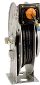
Optional "TR" roller position shown. "SR" roller position is standard.