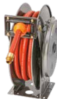
Gas/Diesel fuel hose shown with optional "TR" roller position shown. "SR" roller position is standard.

Note: *Must specify roller position SR, VR, TR. See back page for roller position information.