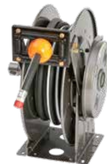
Optional "TR" roller position shown. "SR" roller position is standard.