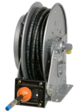
Standard "SR" roller position shown is standard.