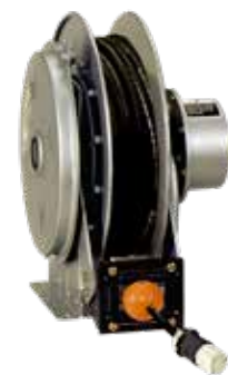
Standard "SR" roller position shown is standard.

Note: *Must specify roller position SR, VR, TR. See back page for roller position information.