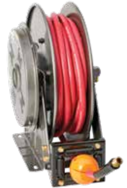
Standard "SR" roller position shown is standard.